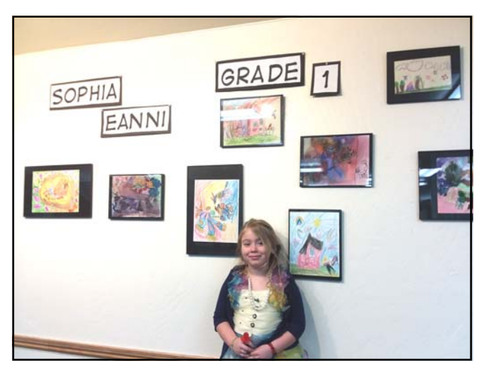
This Month's Student Art Gallery